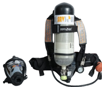
Breathing Apparatus Set