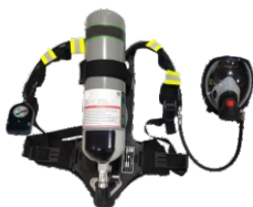
Saviour Breathing Apparatus Set