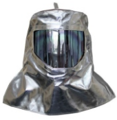
Hood with visor & Helmet cover