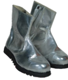
Heat Resistant Shoes