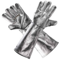
Insulated hand gloves