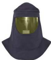
= ARC Hood