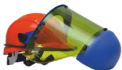
Electrical Helmet with ARC Visor: 40 Cal/c m 2