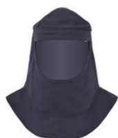
Hood: Fabric Arc Rating: 40 Cal/cm 2