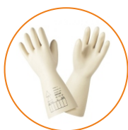
Electrical Glove/ Arc Gloves